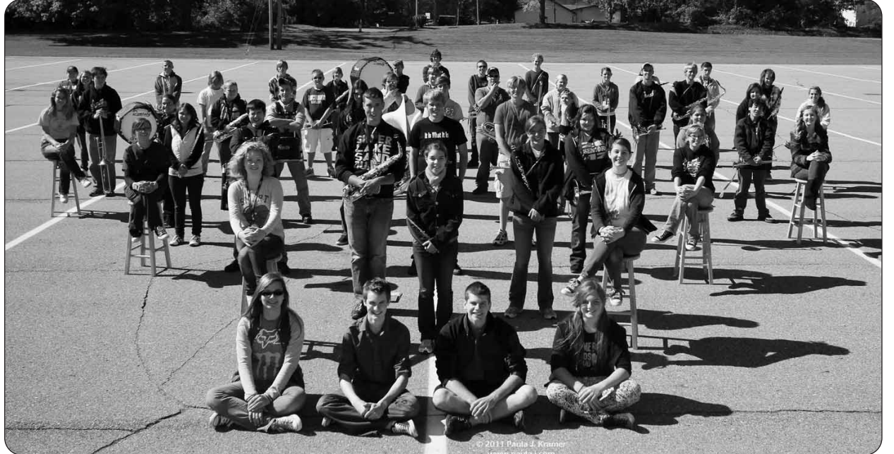
The Columbia Central High School marching band placed first in competition at the Huron Valley Invitational this fall earning them a trip to the state finals in November at the Ford Field in Detroit. The band also earned awards for Best Music as well as Best Visual Effect. At the state competition their performance featured music from the musical Les Miserables . Over forty of the state's best bands vie honors in four classifications to complete their marching season.